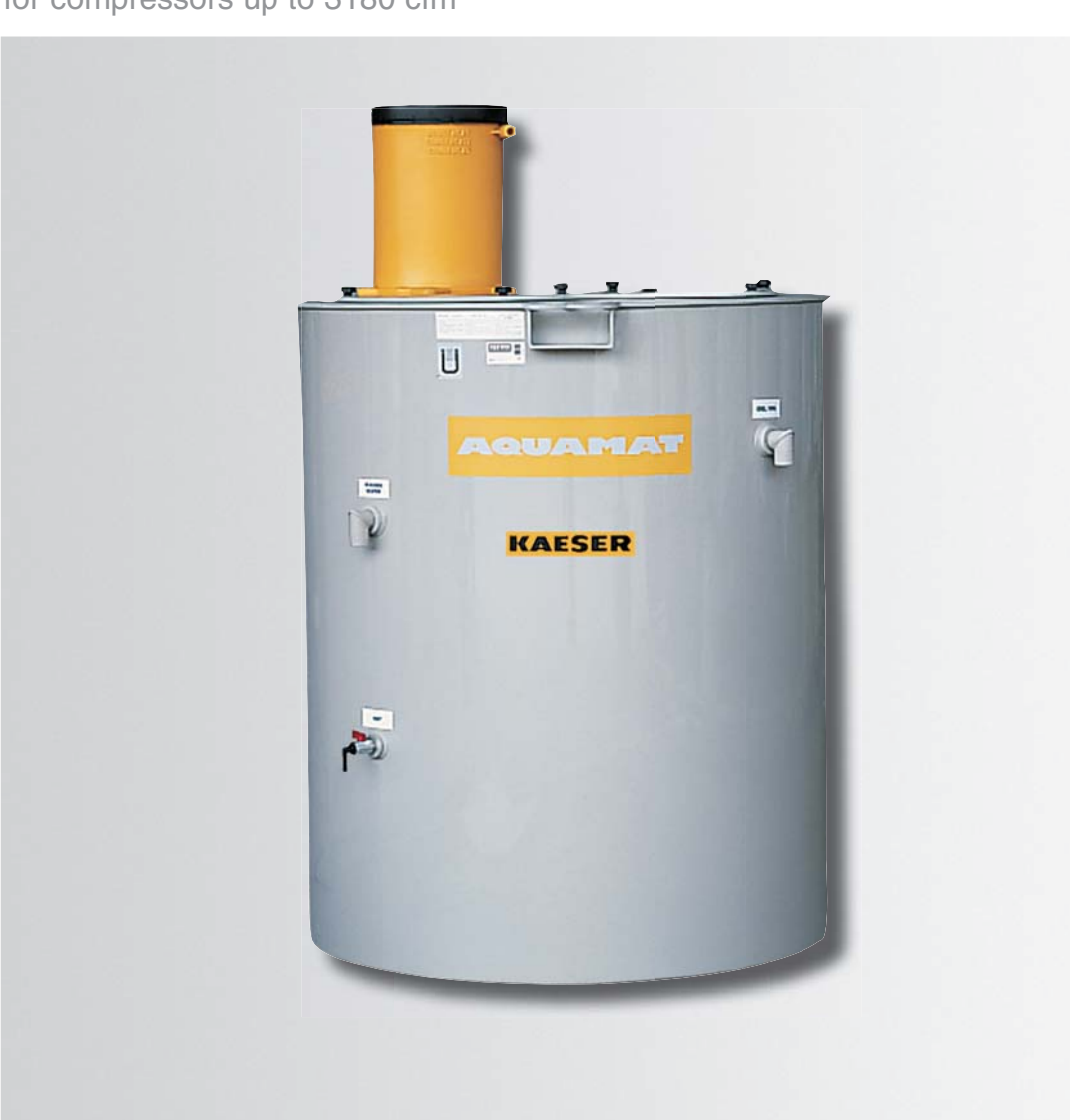
Aquamat 8 for compressors up to 3180 cfm